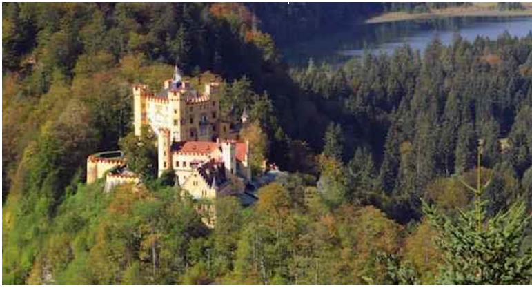
Hohenschwangau Castle, Ludwig's childhood home